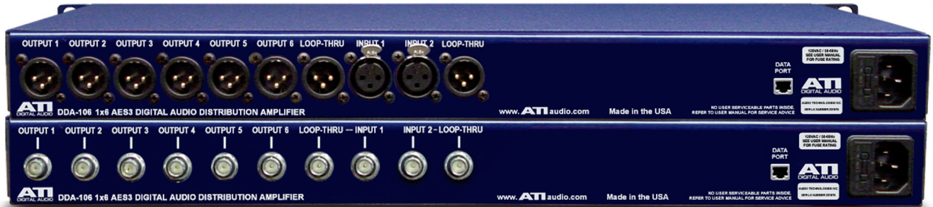
DDA-106XLR & DDA-106BNC Rear Panels