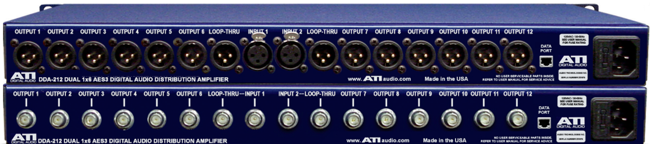
DDA-212XLR & DDA-212BNC Rear Panels